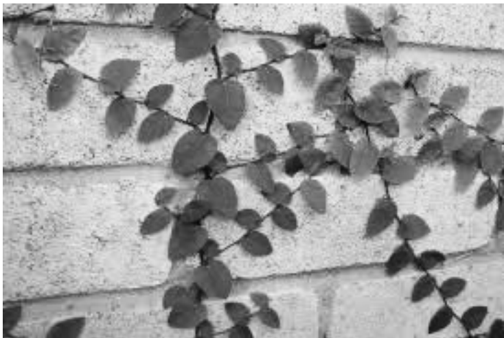
Fig Vine is very invasive and causes damage to the structures it clings to.

We have recently applied to the City of Saratoga for a permit to remove 3 trees; two redwoods in the 300s and a Chinese Elm in the 500's. You may have received a notice in the mail from Kate Bear, the City of Saratoga arborist. Please be assured that the Vineyards only remove trees that are diseased or causing structural damage to our buildings.